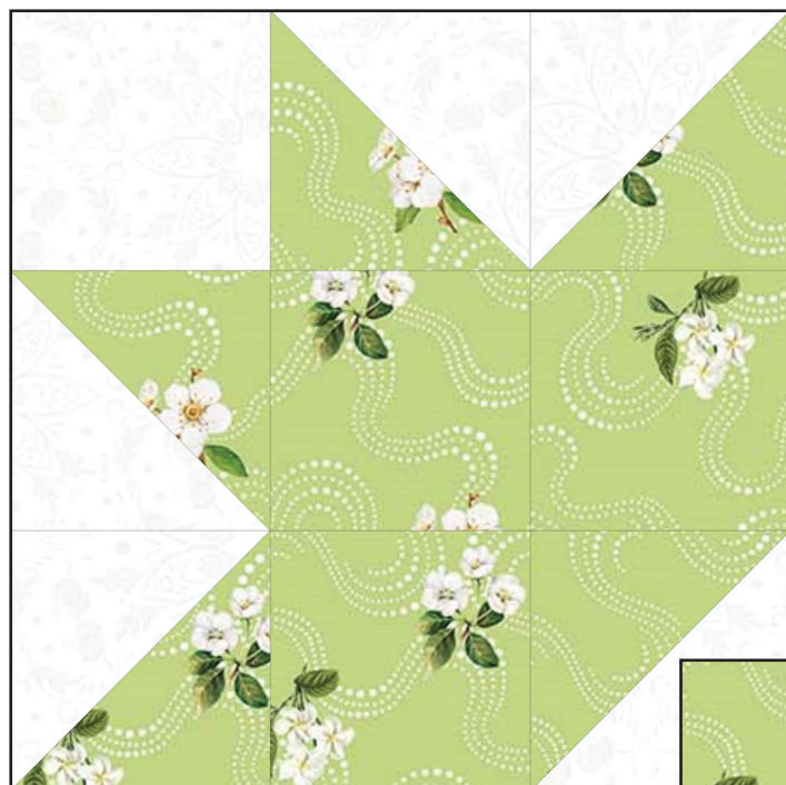
Blocks shown in Bouquet collection DP23090-74 & 23091-10